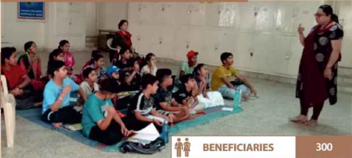
10 day's Sanskrit Sambhasan Class at AWA Class Bhuj