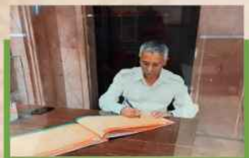
Hon'ble, Manoj Mukund Naravane (Former Chief of Army Staff the Indian Army)