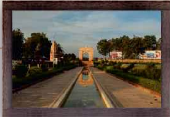
Replica of India Gate