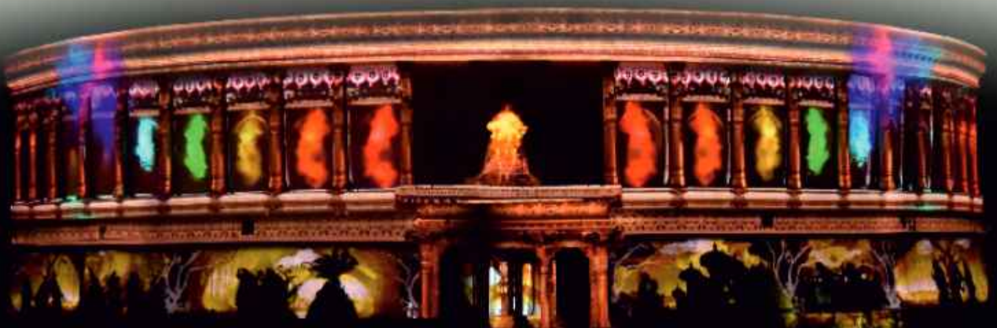
Daily 12 minutes facade show projected after Sunset