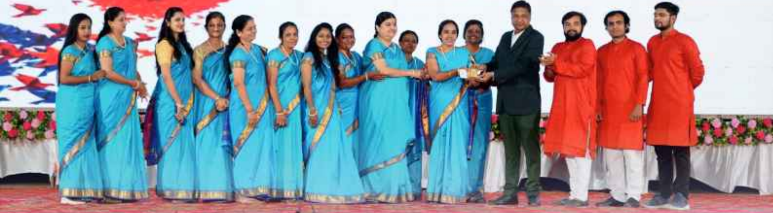
Ashapura Women's Academy Team Receiving Conquer Award - 2022 for the Best Performing Team