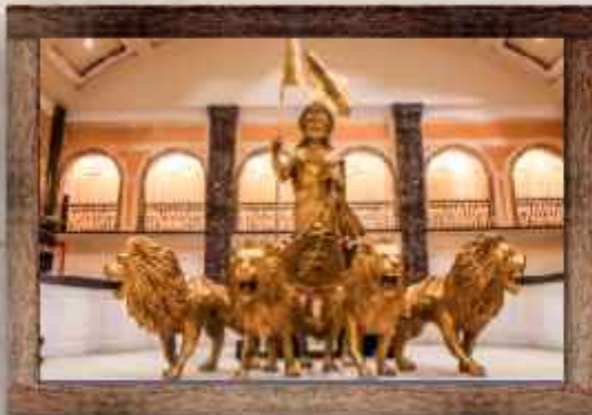
Bharat Mata Statue