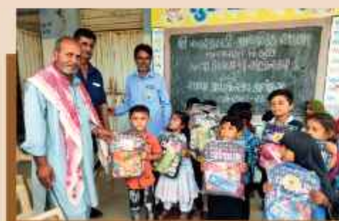
Gifted bags and other accessories to the winners of Essay Competition at Manjal