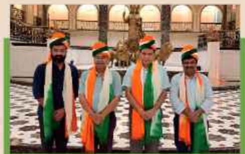
Shri. Suresh Prabhu (Former Minister for Railways of India)