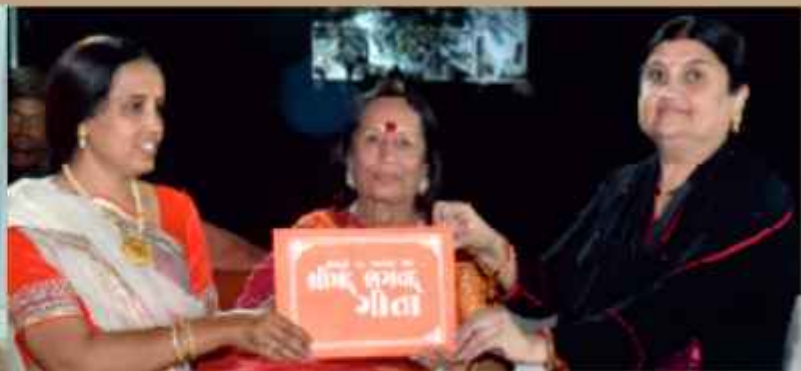
Shrimad Bhagvad Gita Vimochan