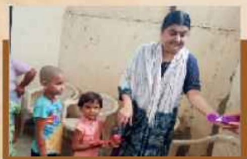
A gift to Ashapura Colony Primary School's students