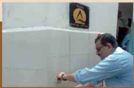
Donation of water filter plant at Ler Primary School during Praveshotsav