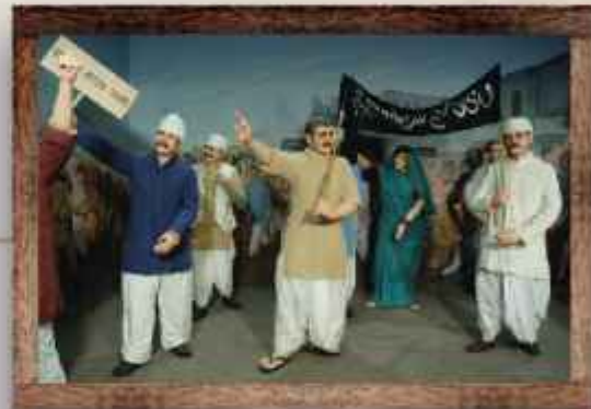
17 Episodes with Life-sized Statues and 4D Technology