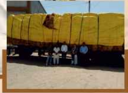
Grass Distribution at Madhapar, Navavas and Junavas