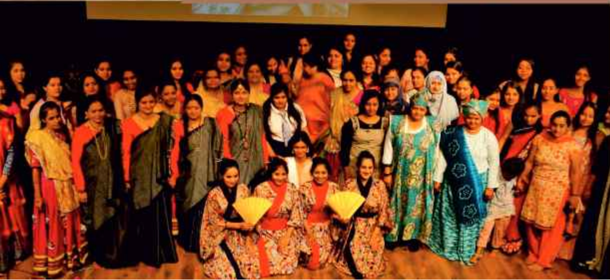
Women day celebration by Ashapura CSR team