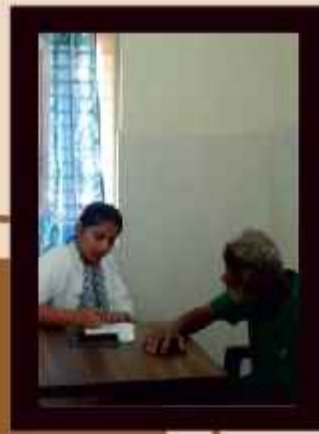
Ayurvedic & Homeopathic Medical Camp at Pragpar