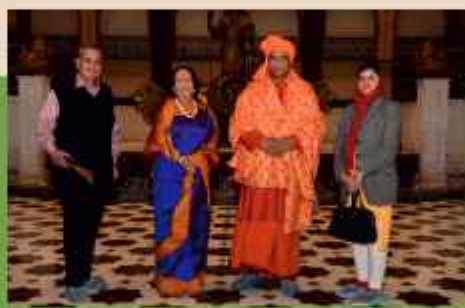
Pujya Shri Swami Girishanand Saraswatiji