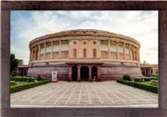
Vande Mataram Memorial Building, a Replica of Sansad Bhavan