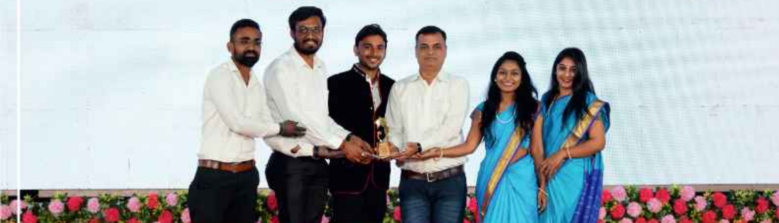
Felicited as Best IT Team for the Year