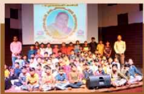
Mangal Mandir school's students while praying at Vande Mataram Memorial on Baa's Punyatithi