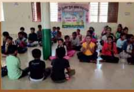
Kids Summer Camp at Mining Area Villages