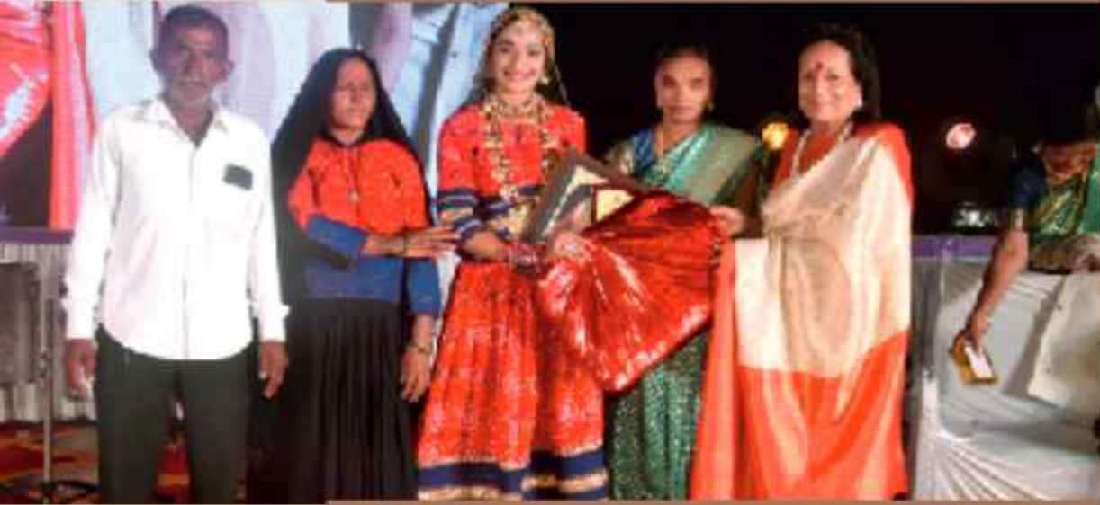
State level winner, Ashapura Women's Academy music trainee