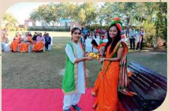
Music & Kathak Performance by Ashapura Women Academy class student