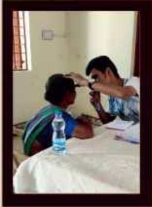
Ayurvedic, Homeopathic & Eye Camp at Kukma