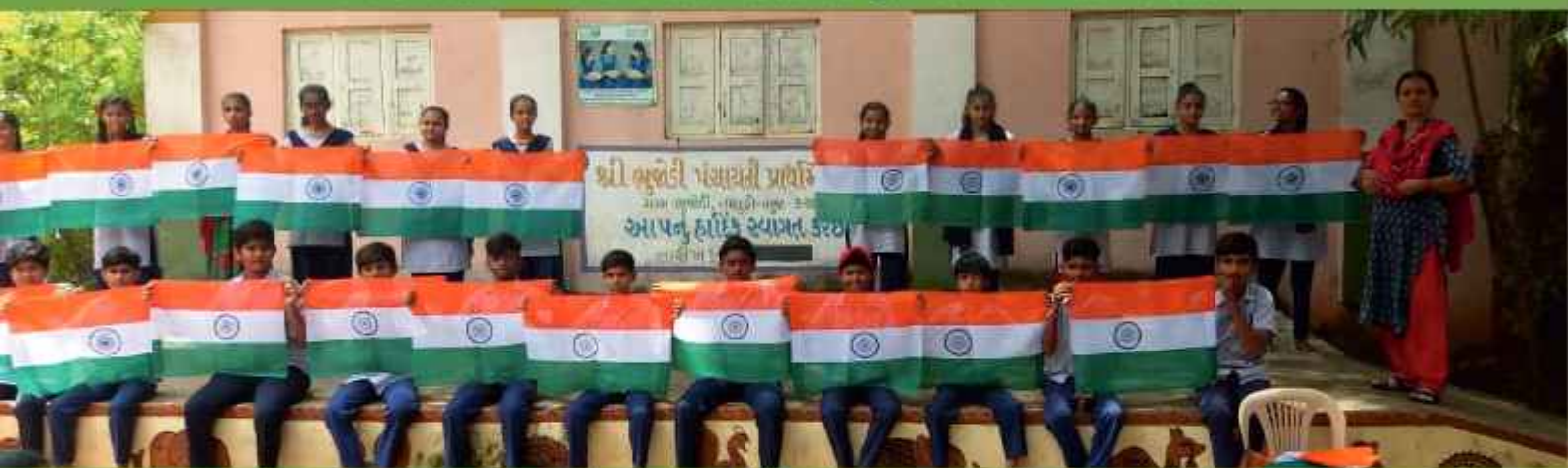
Flag Distribution on the theme of 'Har Ghar Tiranga' at Mining Area Villages