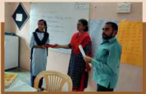
Winners of Essay competition at Manjal