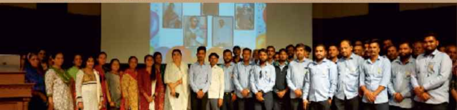
Monthly birthday celebration of employees as part of good corporate practices