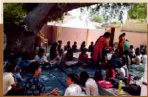
Summer Camp at Baraya

area. Our mission is to promote education for all and we are engaged in various activities, such as distributing School Kit, organizing contests such as essay writing, drawing, etc. Also provided infrastructure facilities to schools including donating of water filters.