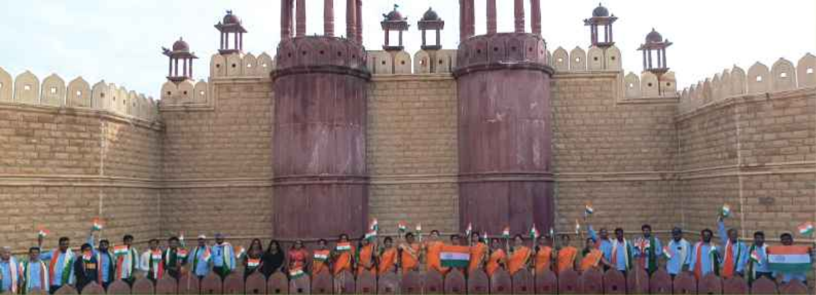
Vande Mataram Memorial Staff Celebrating 'Azadi Ka Amrut Mahotsav'