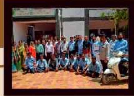
The Team of Ashapura Group of Industries who made the Medical Camp successful